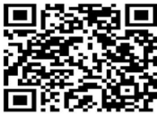
Youth meal Signup

Please consider signing up to host a meal for the youth soon! A Sign-Up sheet is on the bulletin board, or you can do so digitally with Sign-up Genius QR Code below