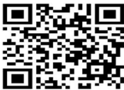
In-Depth Bible Study